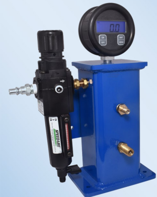
Pressure Range: 0-200psi

ALSO AVAILABLE IN DIGITAL! DILL P/N: 8500-D